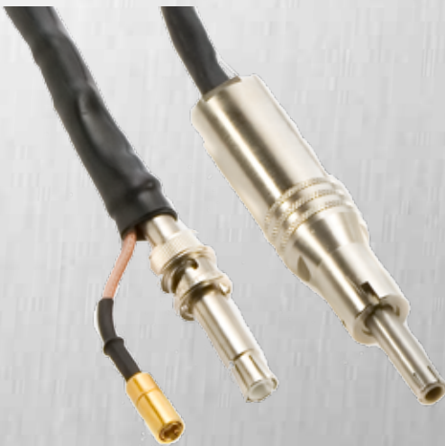
SAFECONN Controller and Pump End SHV 10 KV Connectors