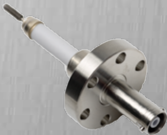
SAFECONN SHV 10 KV High Voltage Feedthrough

The integrated SAFECONN™ high voltage interlock system was introduced by Gamma Vacuum to create a safe environment when working with the high voltage cables of an ion pump.